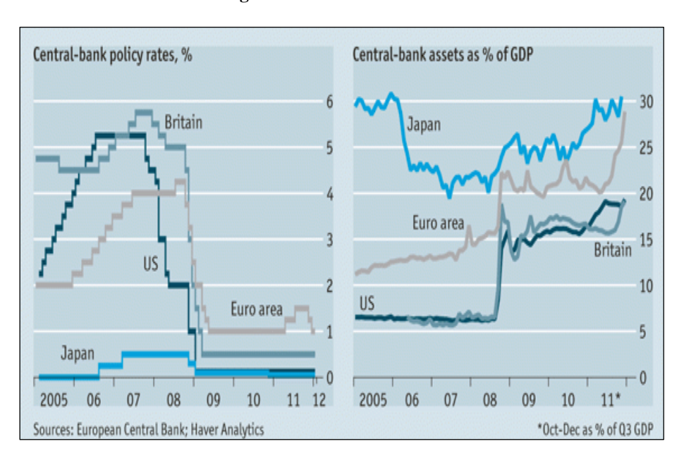
Figure 3. Non-standard bearers

The strength of the Swiss franc took central bank innovation one step further. The Swiss National Bank decided in September 2011 to buy unlimited quantities of euros (funded by printing additional quantities of Swiss francs). This was a success, with the Bank generating profits of \epsilon 6 billion in 2012, 80% from its euro purchases.