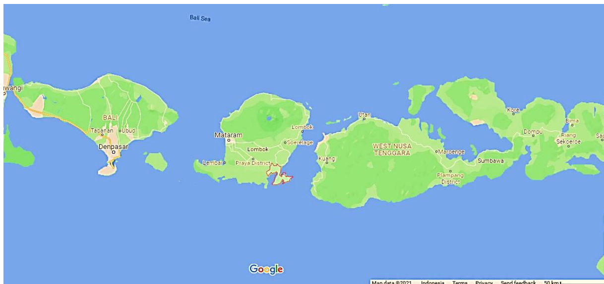
Figure 1. The geographic location of the Jejawaru subdistrict

This study discussed the existence of environmental protection for the Bekayaq Pataq Pare tradition on the behavior of local actors in an empirical approach to legal anthropology and how the tradition is studied with the theory of behavioral change in actors in the agrarian community. This study was conducted in the Sasak community of East Lombok in Jerowaru village, Jerowaru district, East Lombok Regency, West Nusa Tenggara Province. This research aims to find and analyze the wisdom of indigenous people in protecting traditions, especially Bekayaq Pataq Pare in the Sasak community of East Lombok, West Nusa Tenggara, related to the current laws and regulations concerning the inhibiting factors and external supporting factors found in the community.