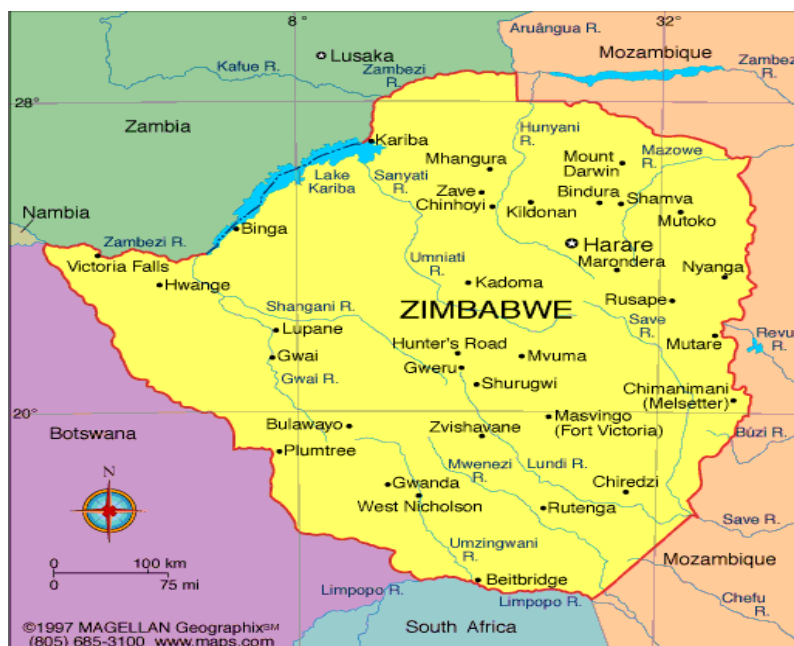
Figure 1. Location of Zimbabwe