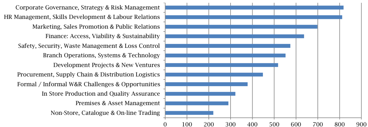
Figure 1. Overall W&R sector survey findings: national research priorities

For each of these priority areas, a number of research topics were identified from the overall responses - these were termed "Burning Issues" for priority in-depth research.