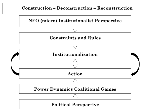
Figure 1. Action and institutionalization processes