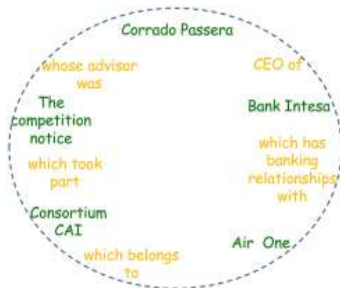
Figure 2. Some of the interests involved