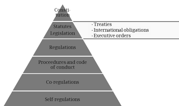
Figure 3. The hierarchy of laws in relation to forensic accounting

As a codified legal system, the Jordanian law comprises a set of rules and principles that can be identified, written down, and followed. Nevertheless, the Jordanian body of law has evolved over many decades from a variety of sources and constantly subject to change and development. Ultimately, any conflicts of law or legislative gaps must be resolved either by the courts or by the legislature through the enactment of unequivocal legislation. Even then, decisions of the courts and legislation can be subject to challenge.